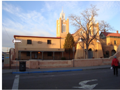
The Church in Old Town, Albuquerque, NM Site of APCE Conference 2011

The GLAPCE LAMP AWARD is presented occasionally to someone who: