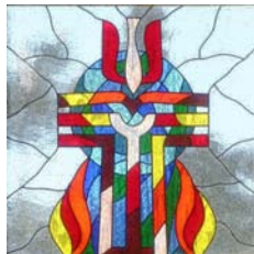
Stained glass PCUSA symbol located in the window of the Tahoe Center dining hall at Zephyr Point

Visit www.apcenet.org for a list of current APCE cabinet members.